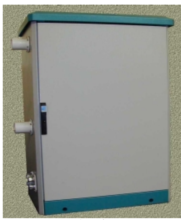
Fig. 2. Irradiator.

As a result of such an integrated design approach, we succeeded in constructing rather a compact irradiator with dimensions of 850.700.975 mm and 1480 kg in weight (Fig. 2).