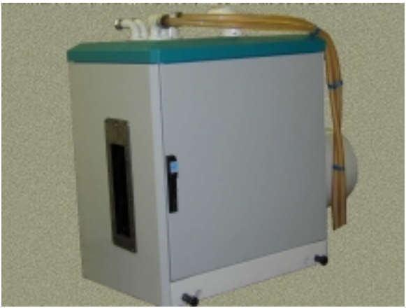
Fig. 3. Magnetron Modulator.

-30°C, is used as a cooling liquid. Necessary temperature monitoring and diagnostics of the status of the refrigerating unit are performed with a microprocessor.